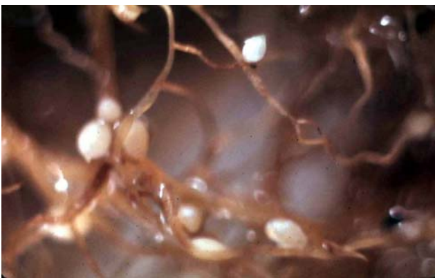
SBCN CYSTS ON HAIR ROOTS

Currently there is ongoing research evaluating potential new products that may be helpful in control of SBCN. These products include seed treatments, foliar applied plant health promoters and soil applied nematicides. If and when effective products are identified information will be forthcoming.