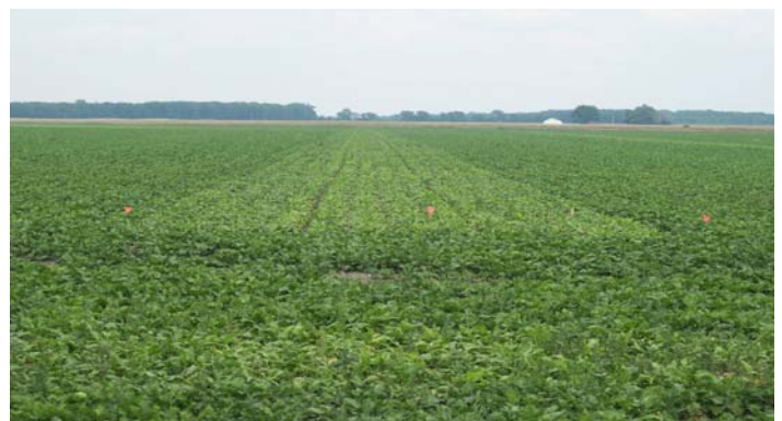
SUSCEPTIBLE SBCN VARIETY IN THE CENTER — OFF COLOR AND LACKS ROW CLOSURE

Population densities can be reduced by growing non-host crops. A SBCN survey conducted in 1998 indicated a strong correlation between numbers of sugarbeet crops grown over the past 20 years and population densities of SBCN. The higher the number of beet crops, the higher the SBCN population densities. From the survey, it appeared 4 or more years between beet crops is necessary to effectively manage the pest using only rotation. Cyst numbers decline by 50% per year in non-host crops. Grains (grasses), clover, corn, soybeans, dry beans and pickles are good choices as non-host crops. Wheat under seeded with clover can reduce SBCN and improve soil health.